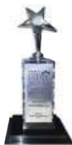
KOLTE-PATIL Developer of the year 2014 Estate Awards